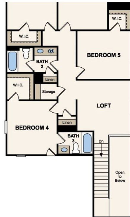
OPT. BEDROOM 5/BATH 3